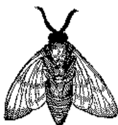
Abbildung 2: A sample black and white graphic (.eps and .pdf format) that has been resized with the \includegraphics command.

This sample document contains examples of .eps, .pdf and .ps files to be displayable with L A T E X. More details on each of these is found in the Author's Guide .